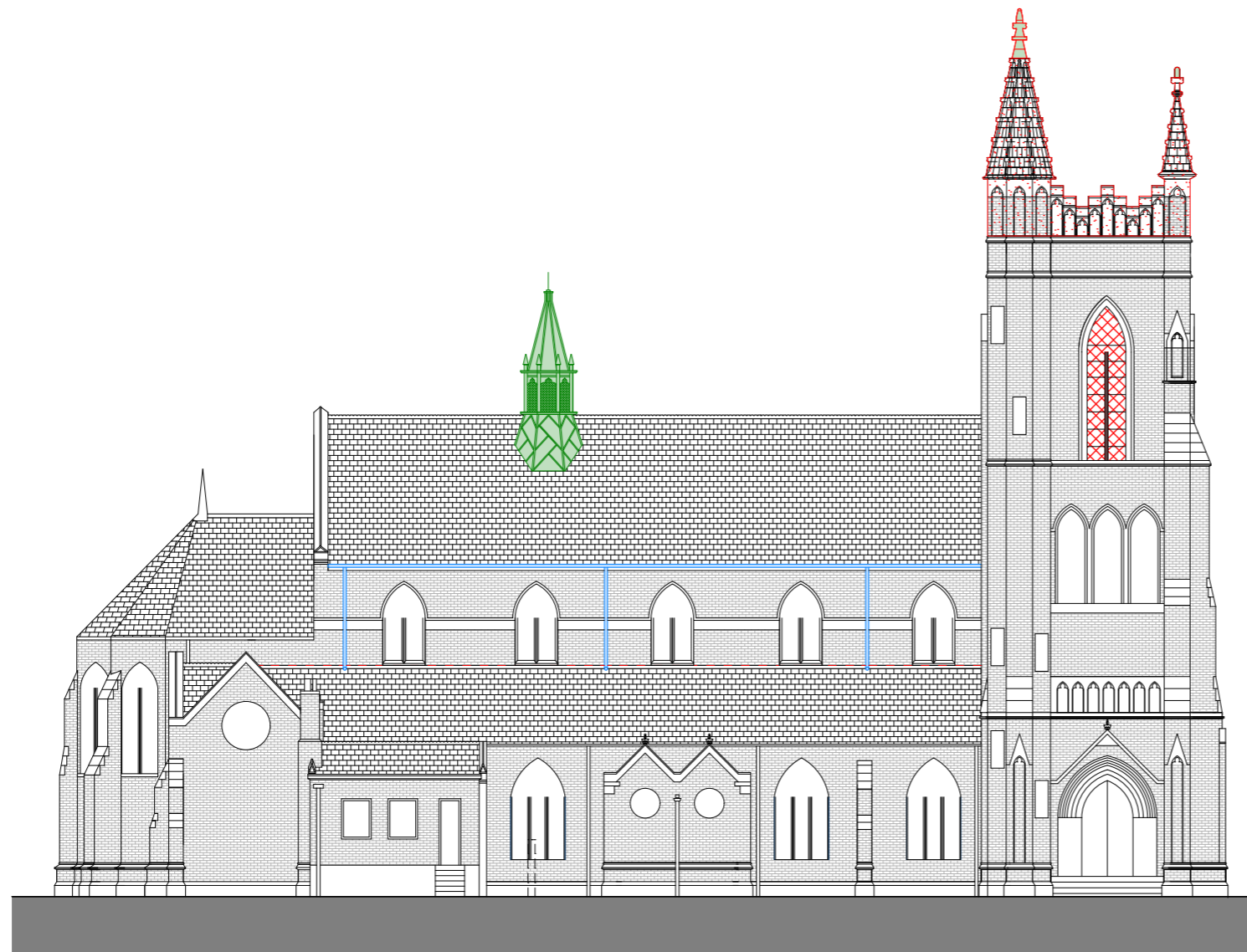
Scope of Work, North Elevation, 1:200

Note: See Schedule of Work for repairs to the stonework of the Belfry Openings